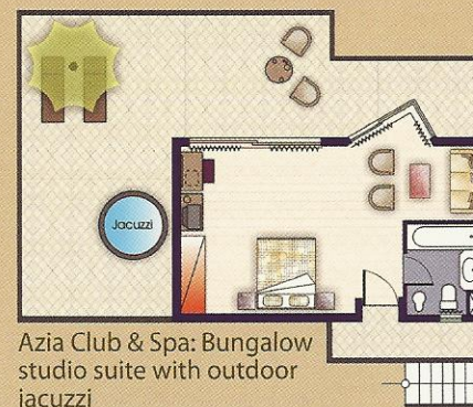
Azia Club & Spa: Bungalow studio suite with outdoor jacuzzi