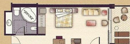
Azia Club & Spa: Skylight junior suite sea view